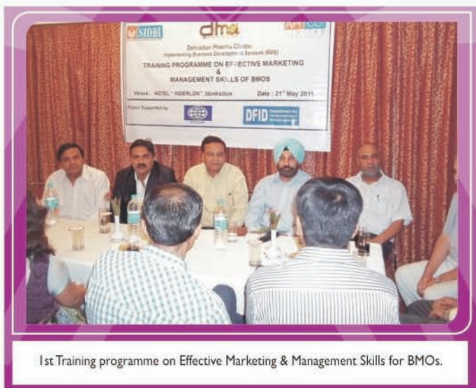
1st Training programme on Effective Marketing & Management Skills for BMOs.

Training programme on Effective Marketing & Management Skills for BMOs at Dehradun and Haridwar