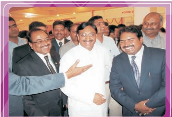
Chief Minister of Uttarakhand appreciating the Cluster Development initiatives of APITCO.