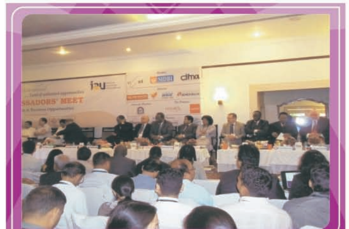
Uttarakhand Government explaining growth of Pharma Sector, at the meet of Ambassadors.

Government of Uttarakhand in association with the Industries association of Uttarakhand (IAU) had organized an